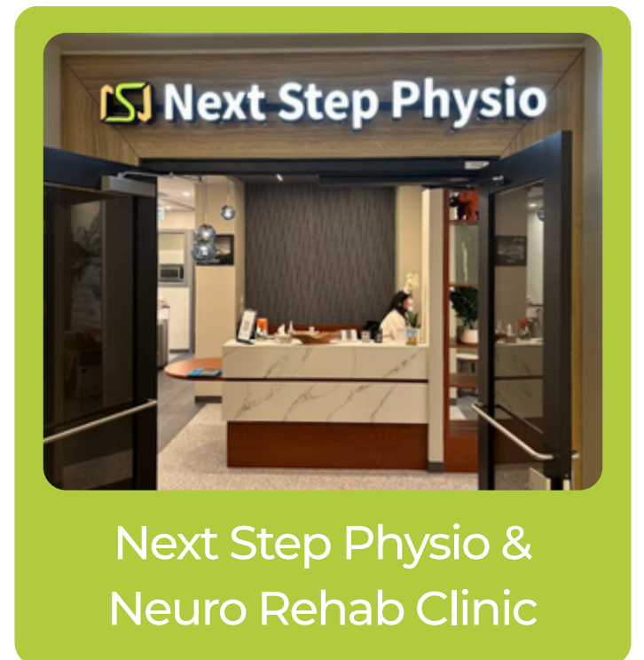
Next Step Physio & Neuro Rehab Clinic