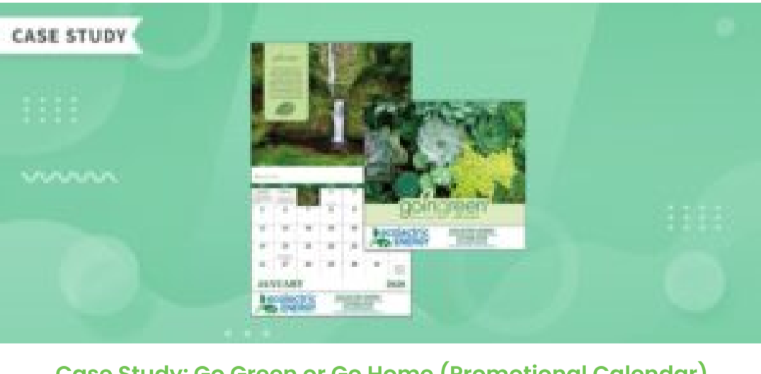
Case Study: Go Green or Go Home (Promotional Calendar)